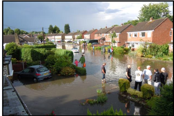
Surface water flooding in Derbyshire

Surface water flooding, often referred to as pluvial flooding, occurs when rainwater or other precipitation does not drain to the subsoil/watercourse but lies on or flows over the ground surface instead. Surface water flooding is often associated with all other sources of flooding and is often related to runoff over steep sided land.