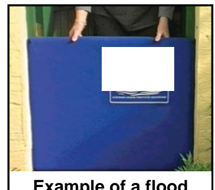
Example of a flood defence product