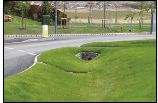
Example SuDS: A roadside swale

Traditionally surface water has been managed by using underground piped systems to transfer water to local watercourses or local sewerage works as swiftly as possible. Sustainable Drainage Systems or SuDS provide a slower more sustainable approach and can provide a multitude of benefits for managing surface water including helping to reduce flood risk.